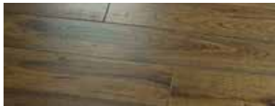
Eliot Hickory NO6ELIH