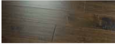
Dickinson Maple NO6DICM