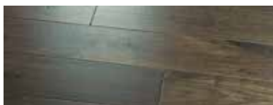
Harper Maple NO6HARM