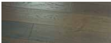
Fitzgerald Oak NO6FITO