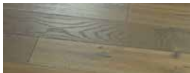
Steinbeck Oak NO6STEO