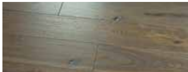
Faulkner Hickory NO6FAUH