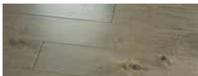
Frost Maple NO6FROM